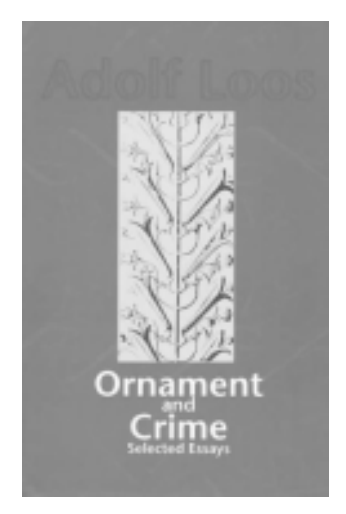
Adolf Loos: Ornament and Crime (1908).

Architecture is a complex make-up of parts, forces, cultural moments, and political ambitions (either aesthetic or secular). This specific choreography of parts always results in the production or an atmosphere, or a whole. As a wholly material practice in the world, architecture relies on atmospheric response and sensitivities to transfer its meaning to the guest. In order to do so, the experiential parts are always more responsive than the academic moments. The structure of a building is just as valued in this regard as the finish of the floor, or the geometry of the cornice. This symmetry in material connotation levels the Loos-ian distinction of any part of the project as ornament. Was there ever such a part to begin with? What is ornament? If architecture truly is the sublimation of its parts into the full creative expression of atmosphere, then ornament is hierarchically equivalent with structure, material, sequencing, circulation, mechanical work, telecom equipment, light outlet, corner guards, concrete sealants, and even more practical and ordinary components to a work.