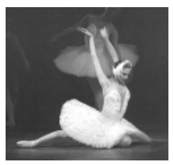
Svetlana Zakharova. Swan Lake (1999).

The relationship between ornament and time can only be discussed in terms of how it's classical definition and any current reinvention, aesthetic significance or re-emerging importance are inappropriate, because there was never a condition called "Ornament" to begin with. But its certainly dead now.